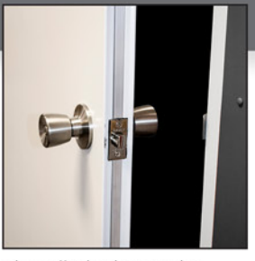
The rolled edge on the 1700-Series gives the door a commercial and finished look.