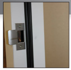
The 1795 has a dual contact jamb weatherstrip for improved weather sealing.