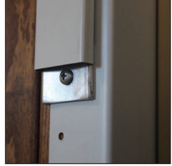
2007-Series doors offer optional casing kits for adjustable jamb components.