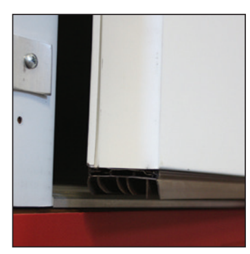
With a heavy duty 6 fin door sweep, the 2007-Series doors has a great seal on the threshold.