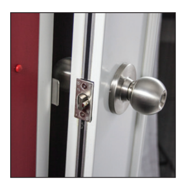
The rolled edge of the 2000-Series doors gives them a commercial and finished look.