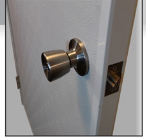
The 1800-Series features a capped edge panel for enhanced durability.