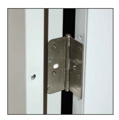
1900-Series hinges mount to door panel surfaces for easy swing changes -- even with pre-installed window lites.