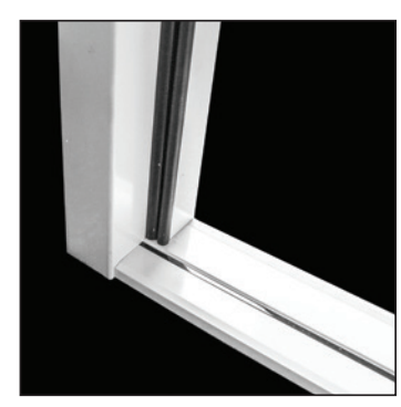
With dual contact weatherstrip and a thermally broken threshold, the 2004STB and 2005/2006TB & TBSF are ideal for weathersealing.