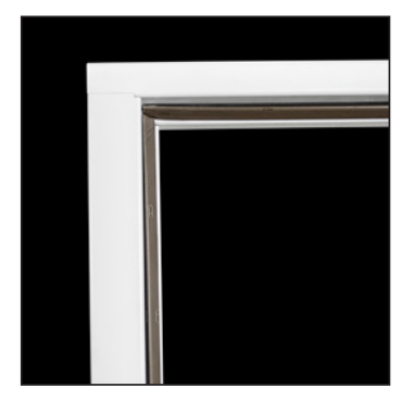
1934 models come equipped with 16-ga. solid headers for increased durability.