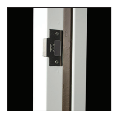
The Kerf Encapsulated Foam weatherstrip on the jamb is field replaceable.