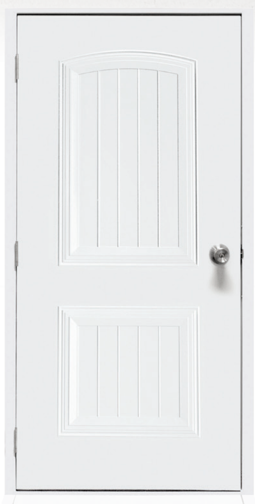
1900-Series with 2 Panel Arch Top Plank embossment (1920 and 1934 models)