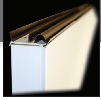
The 1900-Series features a 3 fin bulb door sweep for enhanced weather sealing capability.