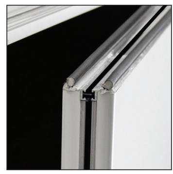
Dual bulb top / bottom sweeps on the 2004-, 2005- & 2006-Series doors improve weather sealing.